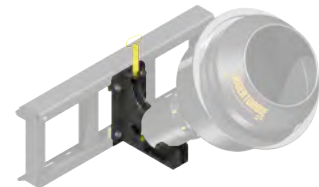
Skid Steer Cradle Frame