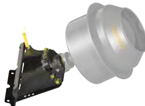
Mini Loader 2-Way Swing Frame