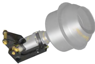
Double Pin Cradle Hitch