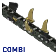
COMBI Mixed terrain