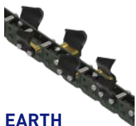
EARTH Soft ground