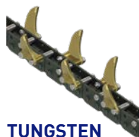
TUNGSTEN Hard ground / Frozen